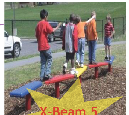
X-Beam 5 $3999