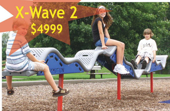
X-Wave 2 $4999