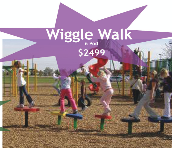
Wiggle Walk 6 Pod $2499