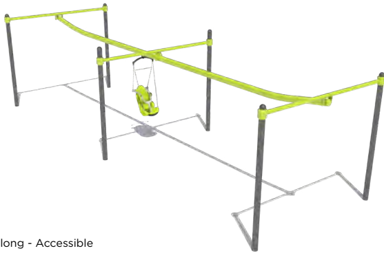
GlideAlong - Accessible