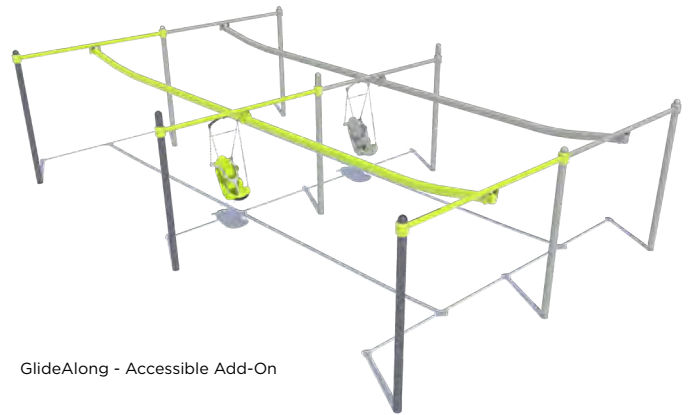
GlideAlong - Accessible Add-On